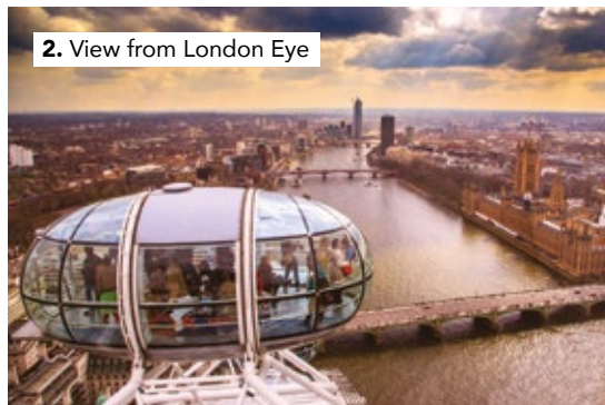
2. View from London Eye