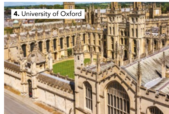
4. University of Oxford